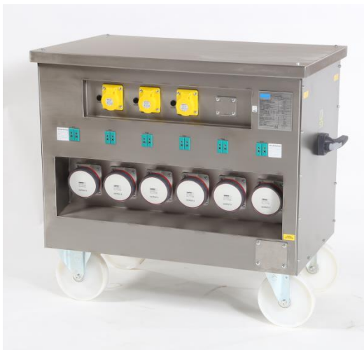
Reverse of unit showing 3 phase, neutral and earth panel mounted, 63A, output sockets.