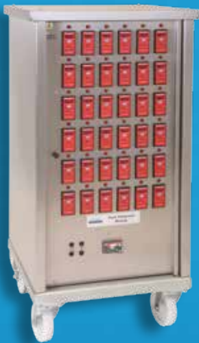
36 Channel Unit

As new techniques develop, new challenges are faced. Therefore, new procedure, techniques and product development is a priority for Stork Cooperheat in order to meet the future requirements of industry. Globally recognised as innovators in thermal technology, Stork Cooperheat are experts within this highly specialised field and can offer the widest spectrum of consultancy services.