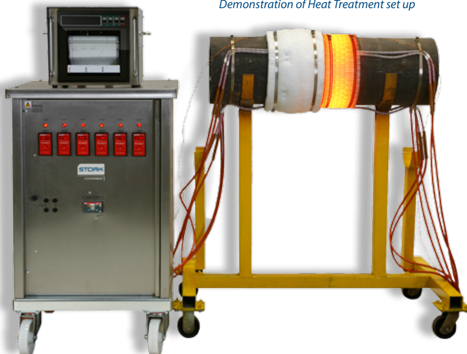
Demonstration of Heat Treatment set up

There are a variety of application methods for heat to weld geometries in order to achieve the desired temperature, ranging from locally applied electrical heaters, to larger gas fired furnaces. The method used is usually determined by the fabrication geometry, size, access restrictions and site constraints.