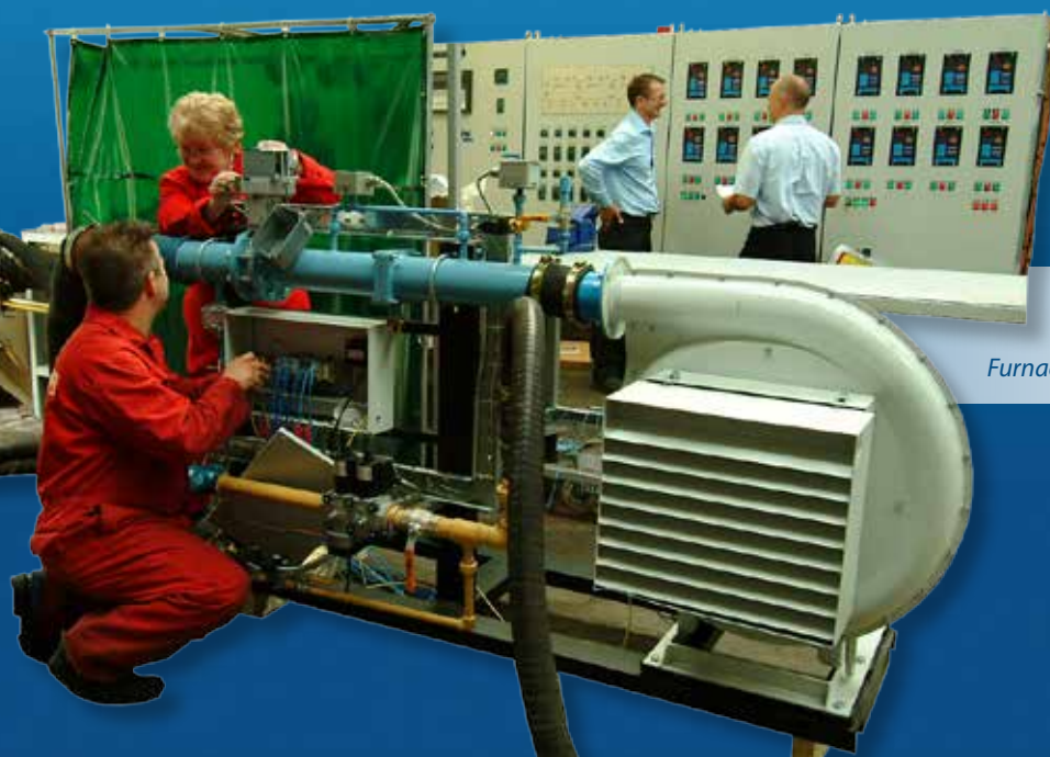
Furnace control panel and burner manufacture

Once the most suitable technical option has been determined, Stork Cooperheat deliver a cost effective and safe, procedure and equipment selection to quickly implement the required solution. With six decades of global experience, Stork Cooperheat can instantly mobilise personnel, equipment resources and engineering support anywhere in the world.